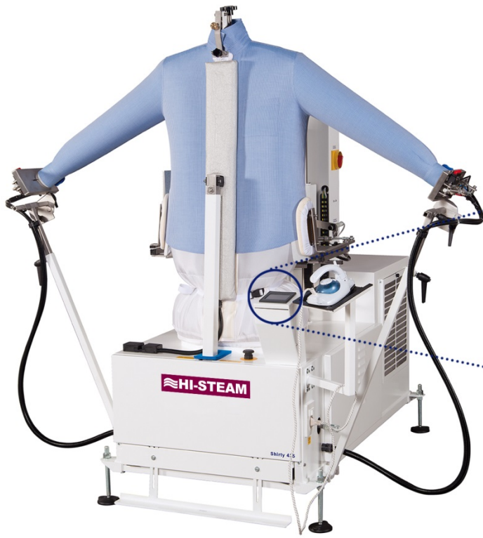
Touch Screen Control