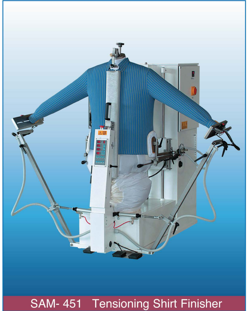
SAM- 451 Tensioning Shirt Finisher