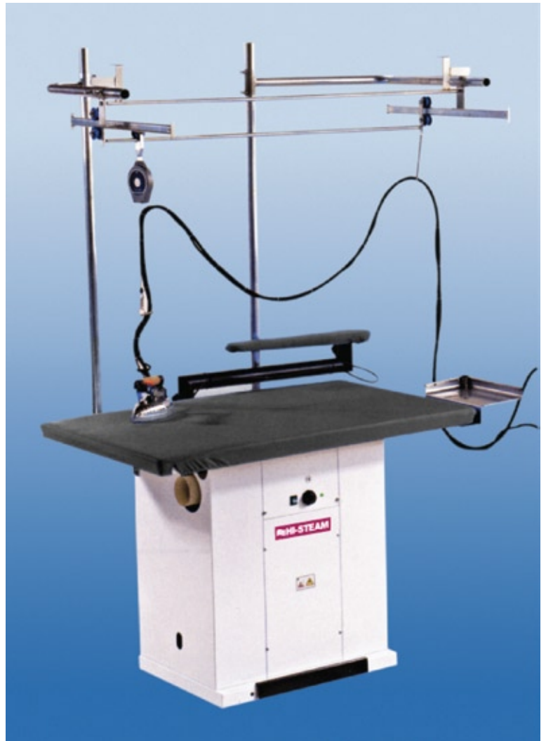
Shown with optional iron conveyor and iron